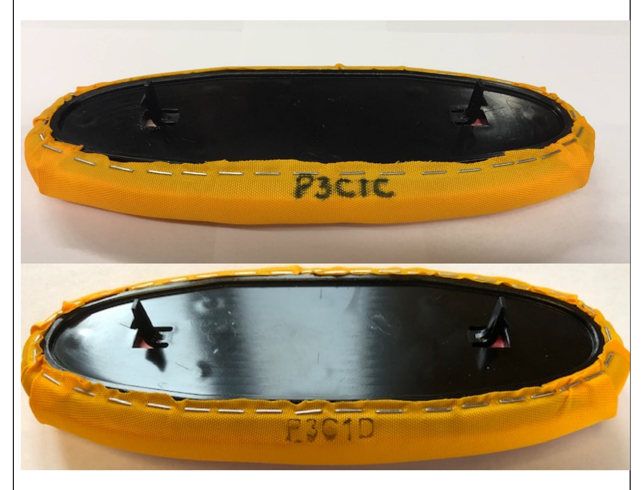
The Product Code is marked on the pad as shown.